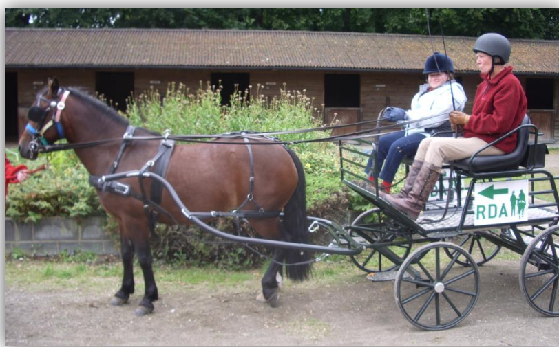
In this picture I am just about to set off on one of the drives with Sweetpea.

The holiday was based at Queen Margaret's School in Escrick who are lucky enough to have their own equestrian facilities and extensive picturesque grounds. We also had full use of the neighbouring Escrick Park Estate which was also perfect for driving. All of the volunteers on the holiday were very friendly and most were experienced drivers themselves. We had four specially selected driving ponies and we had the opportunity to drive not only with a different pony but also with a different RDA whip. This was a good way to get to know the other people on the holiday but also gave an opportunity to pick up driving tips from different people. The pony that I enjoyed driving the most was a lovely little bay mare called Sweetpea. She well and truly lived up to her name and was rather nippy going through cones.