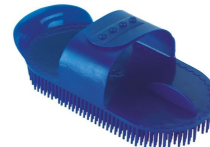
plastic curry comb