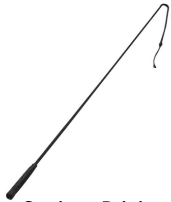
Carriage Driving Whip